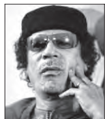
NABERS NABERS Associated Press