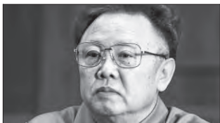
KIM JONG IL

Mary Cleere Haran , 58, actress and singer of classic American popular songs. Feb. 5 George Shearing , 91, British-born jazz pianist who wrote "Lullaby of Birdland." Feb. 14 Joe Morello , 82, jazz drummer on "Take Five" with the Dave Brubeck Quartet. March 12 Nate Dogg , 41, hip-hop singer known for G-funk style. March 15 Ferlin Husky , 65, twangy California country music entertainer. March 17 Ralph Mooney , 82, country music steel guitarist. March 20 Pinetop Perkins , 97, Mississippi Delta blues piano player. March 21 Phoebe Snow , 60, 1970s singer and songwriter. April 26 Gil Scott-Heron , 62, singer, songwriter, poet best known for "The Revolution Will Not Be Televised." May 27 Larry "Wild Man" Fischer , 66, unconventional entertainer who became a cult figure. June 16 Clarence Clemons , 69, saxophonist in Bruce Springsteen's E Street Band. June 18 Amy Winehouse , 27, soul-jazz diva whose self-destructive habits overshadowed her talent. July 23 Dan Peek , 60, founding member of soft-rock trio America. July 24 Jerry Leiber , 78, lyricist who wrote memorable rock